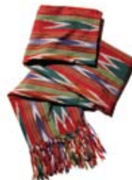
Matta from Il Vostro, $76