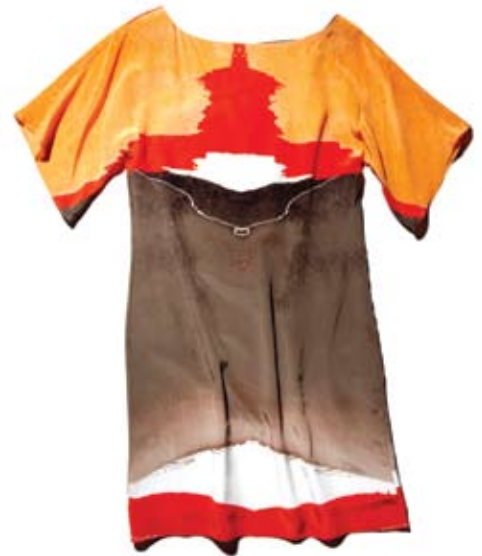
Alice + Olivia from OPM, $253

Tribal pieces make a bold statement, so let them take center stage, starting your outfit with a neutral foundation like black leggings or skinny jeans. But if you're feeling brave and want to mix a couple of prints, try to maintain the same tone, whether it's bright, muted or mostly one color family.