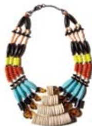
Cocoquette from Cliché, $140

The tribal trend doesn't start and stop with clothes—dress up your summer basics with dangly earrings, beaded necklaces and eye-catching wovens.