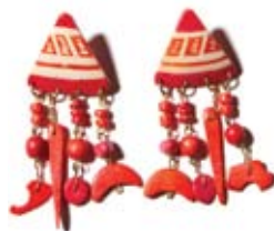
Blacklist Vintage, $12